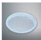
SG7-1 Striped glass