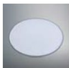
DS7-1 Diffusion sheet