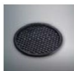
H7-1 Honeycomb louver