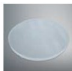
WG7-1 Woven glass